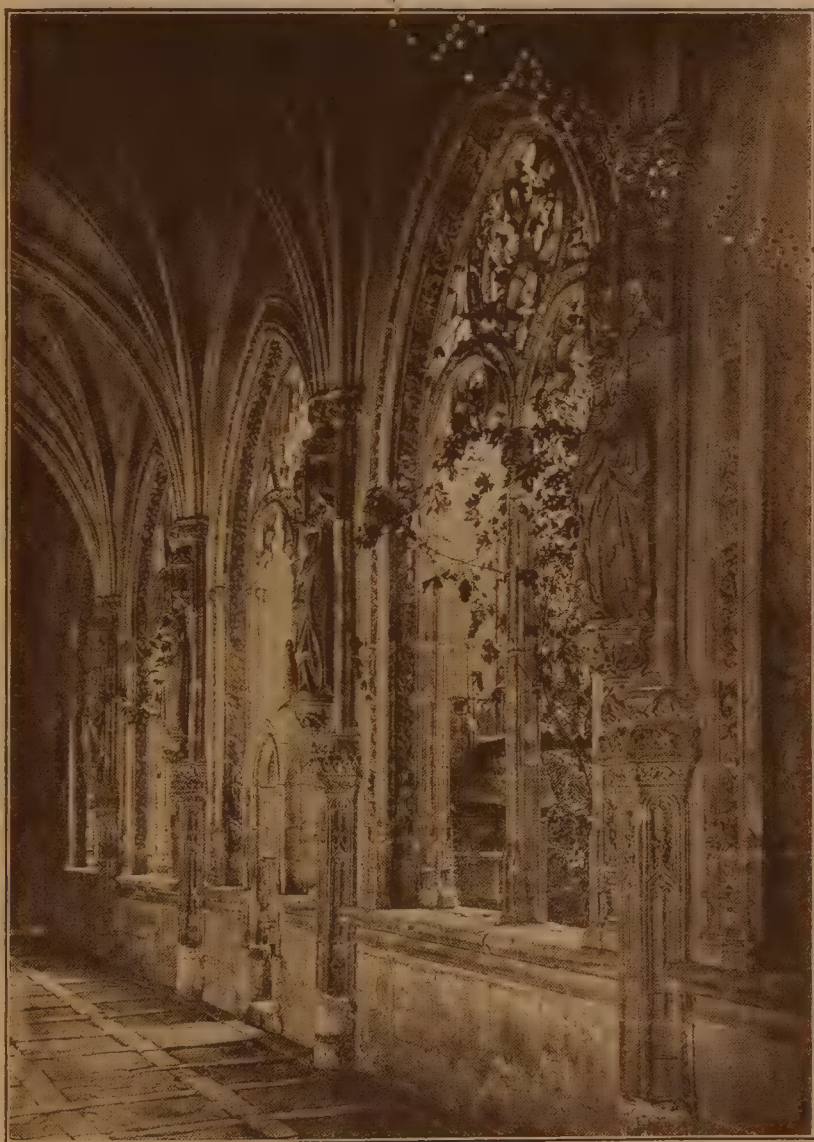
CLOISTER OF SAN JUAN DE LOS REYES